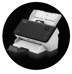
Kodak E1025 and E1035 Scanners

* Throughput speed may vary depending on your choice of application software, operating system, PC and selected image processing features.